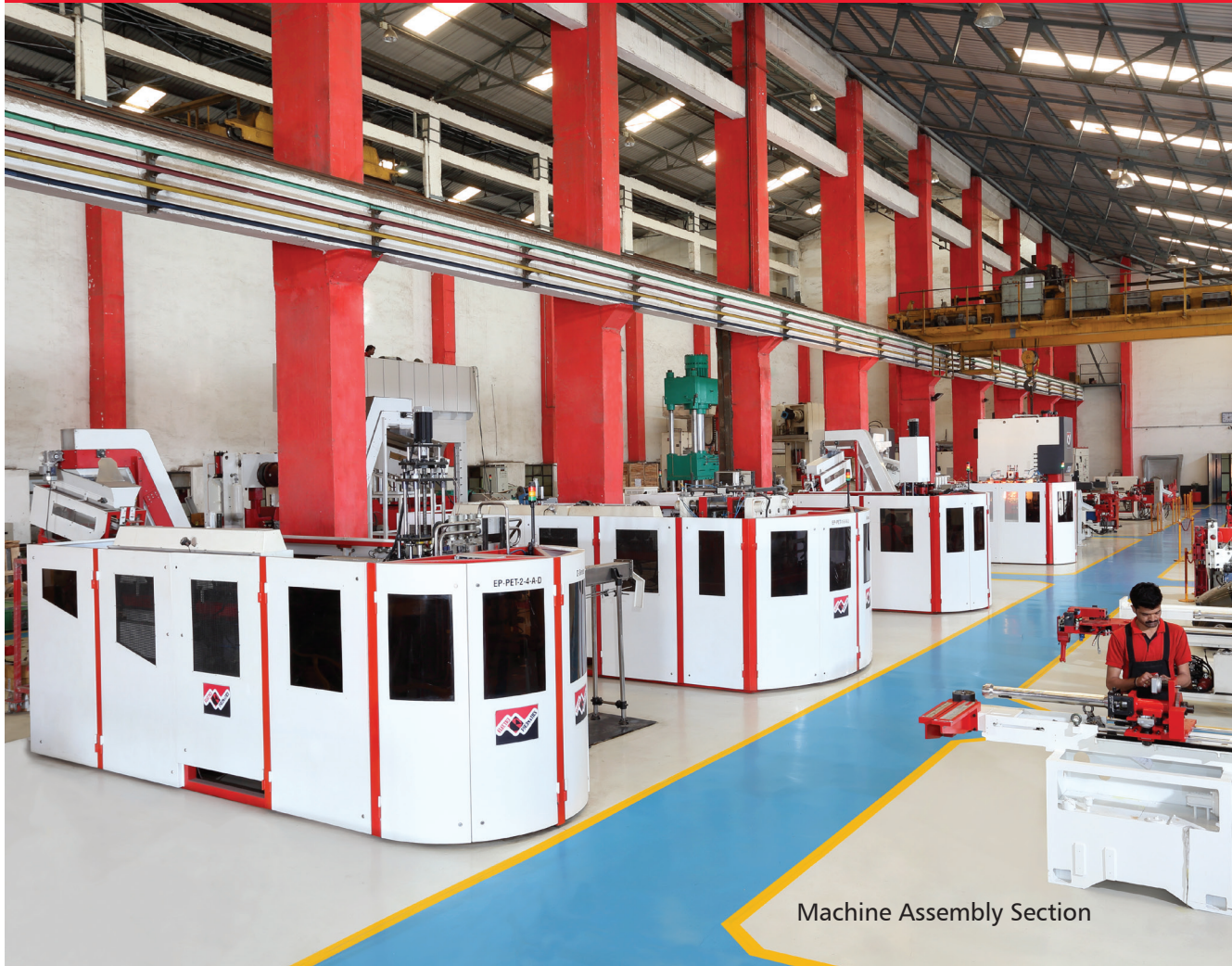
Machine Assembly Section

Complementing its range of metal forming machines, Electro Pneumatics has successfully introduced in the field a range of PET Stretch Blow Moulding Machines for making bottles for water, juice, liquor, syrups, edible oil, carbonated drinks, medicines, cosmetics, detergents and cleaning liquids, pesticides etc. It now introduces its fourth generation of machines which are faster, more efficient and provide the lowest operating costs in the industry.